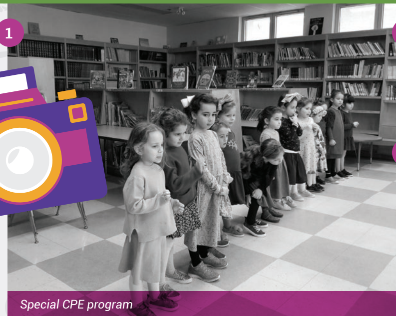
Special CPE program